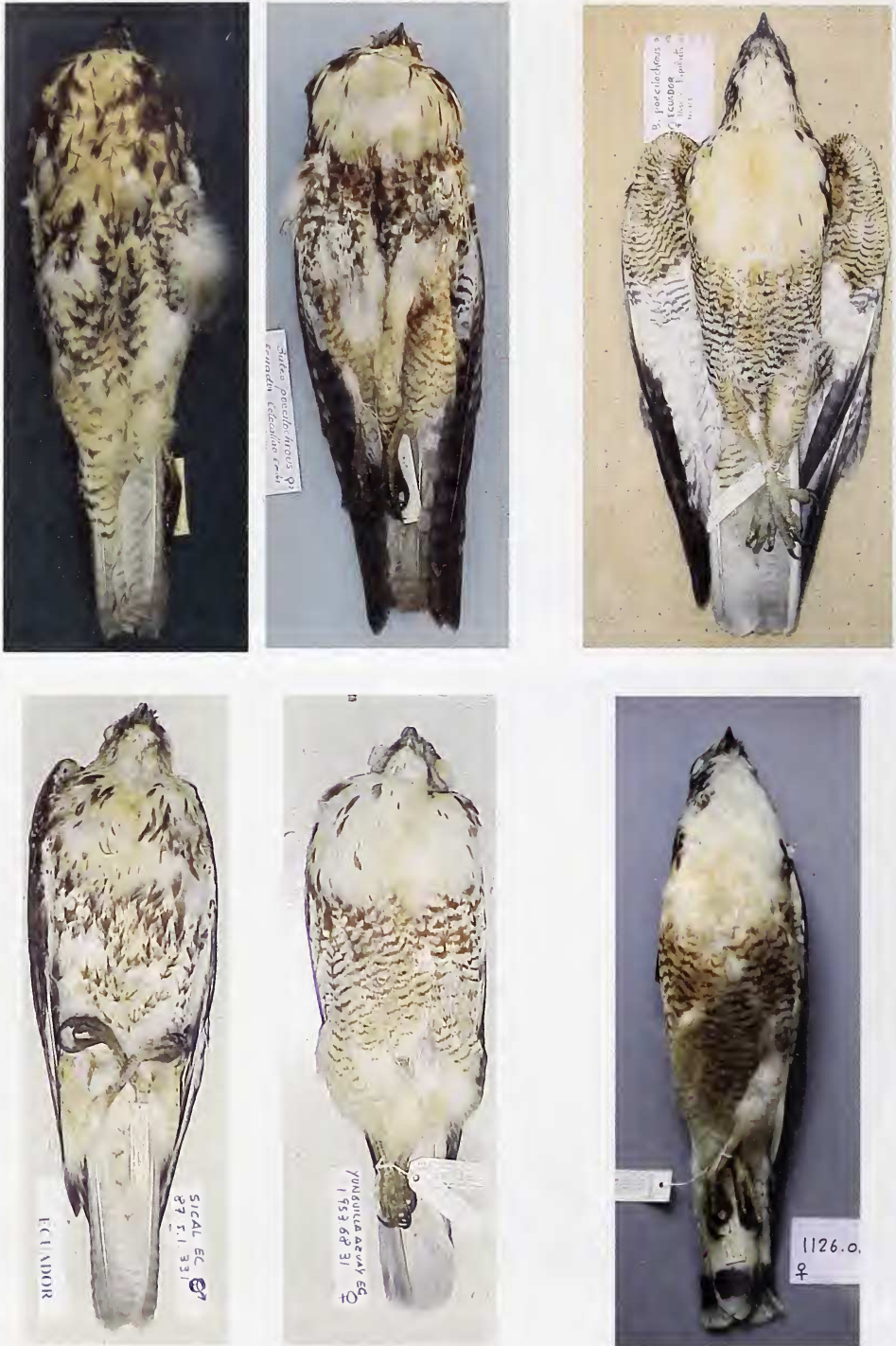
Figure 2. Upper images, pale-morph female Gurney's Hawks Buteo poecilochrous in, left to right, their first-, second- and third-calendar years (specimens held at ZMB, NHRM and MCNQ respectively); below, one first-calendar year male (BMNH) and two, second- (BMNH) and third-calendar year (MHNG), pale-morph female Variable Hawks B. polyosoma. All specimens of both species are from the Ecuadorian Andes, except one from the Colombian Andes